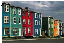
May be Completed at Home