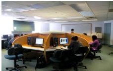
Proctored at NEDP Site or Remotely